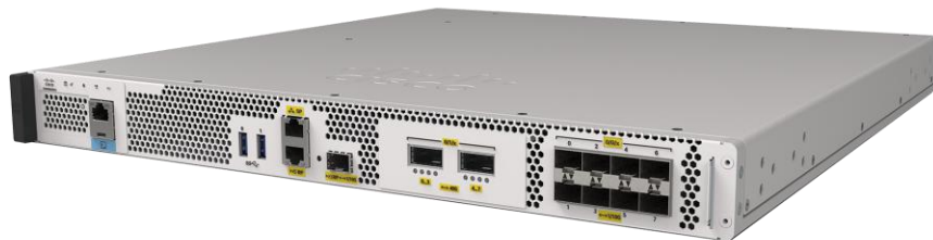
Figure 4. Cisco Catalyst CW9800H2