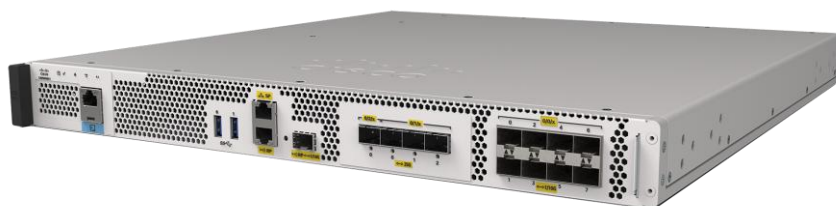
Figure 3. Cisco Catalyst CW9800H1