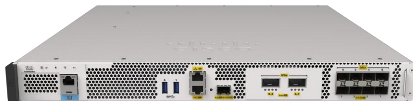
Figure 2. CW9800H2 Wireless Controller

Engineered from the ground up to be the most powerful and energy-efficient wireless controllers Cisco has ever developed, the Cisco Catalyst™ CW9800H1 and CW9800H2 wireless controllers boast up to a 36% increase in performance and consume up to 40% less power compared to the Catalyst 9800-80. Additionally, both the CW9800H1 and CW9800H2 models are built with a space-saving single-rack-unit design, giving you flexibility within your data centers. Together, these advancements, along with a host of innovative features, deliver a best-in-class wireless solution tailored to accommodate the dynamic and evolving needs of your organization.