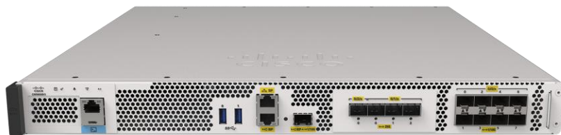
Figure 1. CW9800H1 Wireless Controller